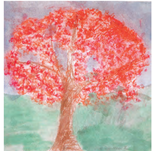
Art courtesy of 7th grade student, The Town School, NYC

In partnership with CSEE, the Character Education Center at University of San Diego offers a Specialist Certificate in Character Development to program participants from our member schools. See details at www.csee.org