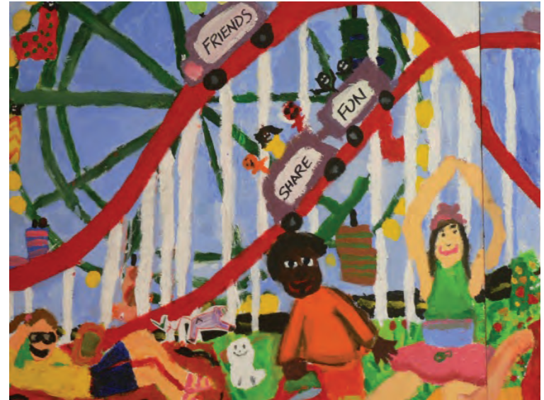
Art courtesy of Berkeley Carrol School, Brooklyn, NY

for more information, visit www.csee.org/consultations